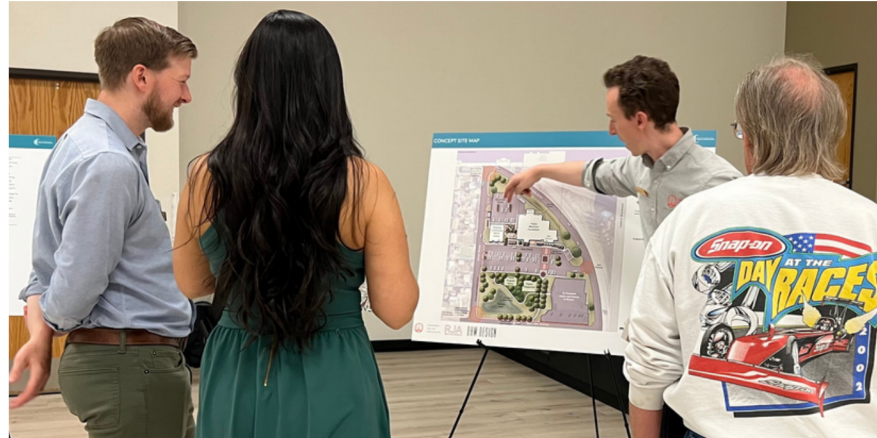
The project design team presented conceptual site plans to the public, illustrating the approximate locations of campus buildings, parking areas, playground, and other elements.